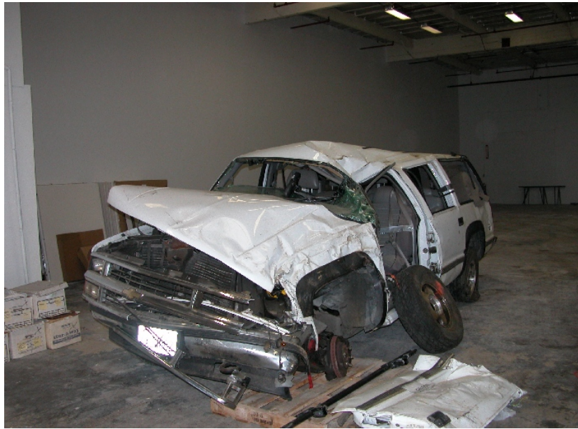
Guerrero v. General Motors Corporation 1997 Chevrolet Suburban Rollover 2 Fatal, Head Injury, Arm Injury