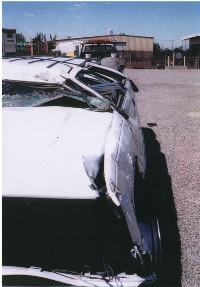
Griesbach v. General Motors 1999 Chevrolet Suburban Rollover Quadriplegia