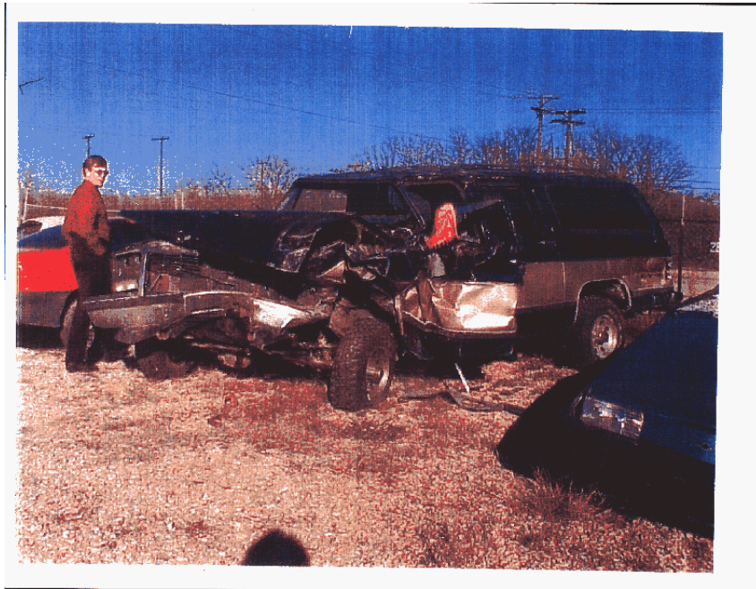
Faulkner v. General Motors Corporation 1990 Chevrolet Suburban Rollover Disabling with very gradual improvement