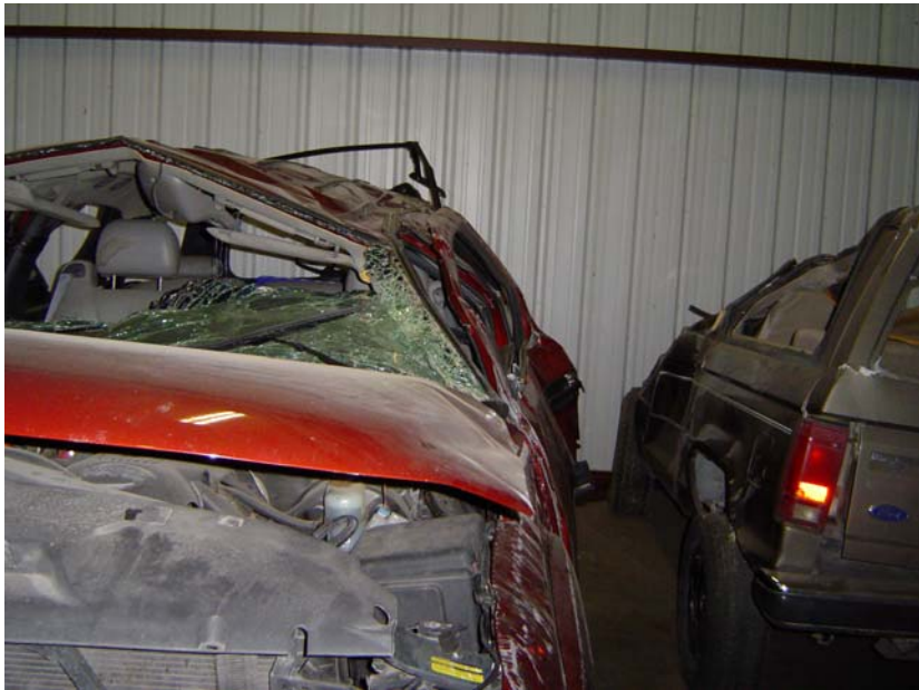
Hurley vs. General Motors Corporation 2002 Chevrolet Suburban Rollover 1 Fatal, 1 Closed Head Injury