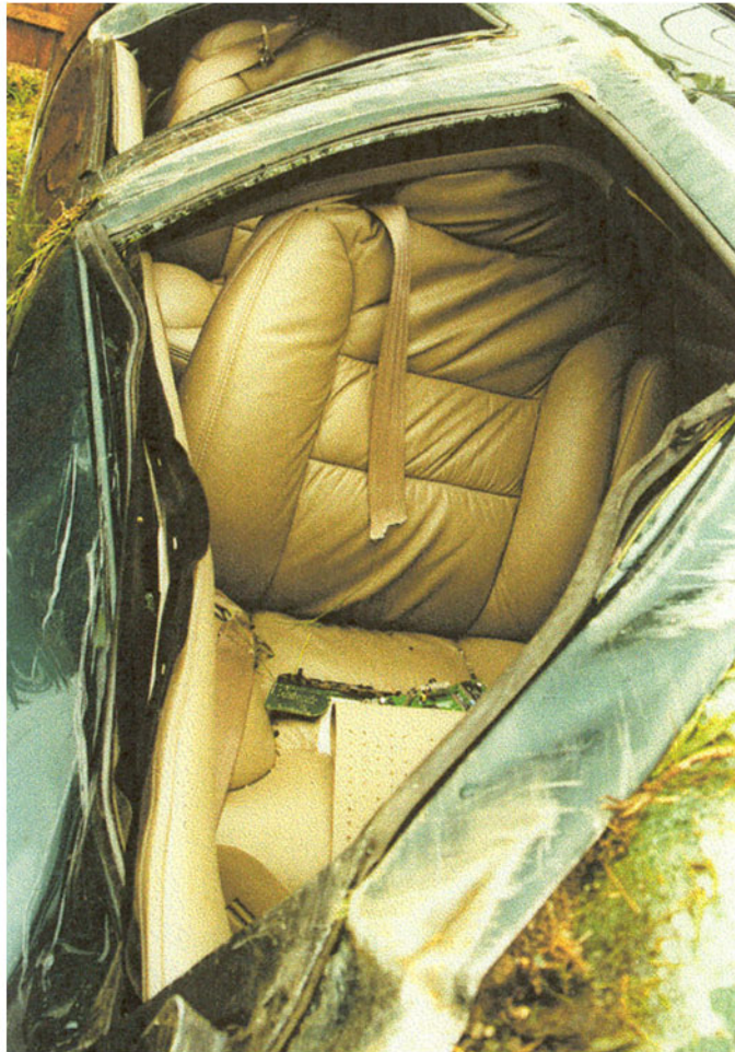
Styles v. General Motors 1996 Chevrolet Suburban Rollover Fatal